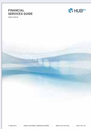
FINANCIAL SERVICES GUIDE

This IDPS Guide gives you information about CAREportfolio Invest (the Service) operated by HUB24 on behalf of GPS Wealth Ltd (the licensee) ABN 17 005 482 726 AFSL 254 544, and is designed to help you decide whether to use our services. It's important you read the entire IDPS Guide in conjunction with the HUB24 Financial Services Guide (FSG) so you can understand how the Service works. It's important that you also read and understand the IDPS Application Form and Contract, and the relevant disclosure documents for any managed portfolios or underlying accessible investments that you've selected.