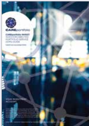
IDPS GUIDE (including IDPS Application Form and Contract)

This Investor Directed Portfolio Service Guide (IDPS Guide, Guide) dated 8 May 2015 for CAREportfolio Invest is issued by HUB24 Custodial Services Ltd (HUB24, the Operator, we, us or our) ABN 94 073 633 664, AFSL 239 122. You should read all of the following: