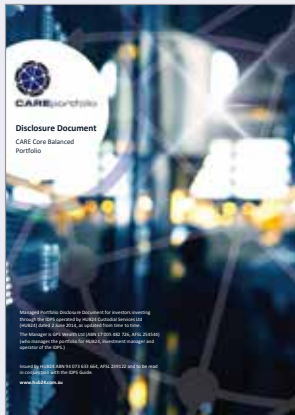
MANAGED PORTFOLIO DISCLOSURE DOCUMENT (for each managed portfolio selected for your investment strategy, which form part of this IDPS Guide. Image shows an example only.)